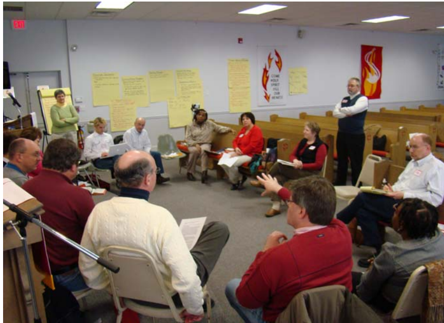
Conference Visioning Table at work

This is a comprehensive area through which the work and life of our Conference administrative ministries are facilitated. These funds support the operation of the United Methodist Center in Lawrence, meet the expenses of our various administrative functions such as legal fees and conference property insurance/maintenance, and salaries and benefits for the Conference's administrative staffs. As part of the Northeast Jurisdiction we support our jurisdictional connectional ministry and the quadrennial Jurisdictional Conference through these funds.